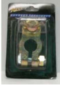
WL-1010-C1 Std Post Zinc with Wingnut (Card of 1)