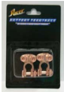
WL-1011-C2 Jap. small Post Copper with Saddle (Card of 2)