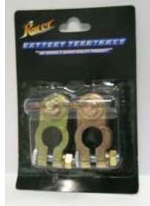
WL-1010-C2 Std Post Zinc with Wingnut (Card of 2)