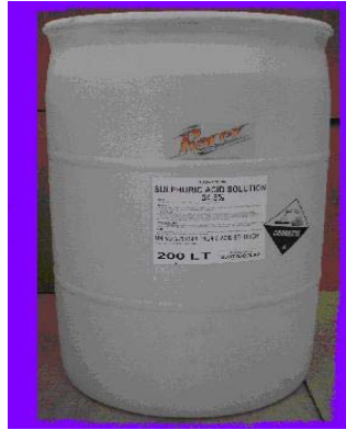
B-ACID 200 RACER BATTERY 200L Refer to Product list

All Racor Batteries have carry handles for ease of replacing & carrying and all batteries are supplied individually packed in boxes making it ideal for shipping and storage.