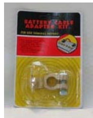
WL-1021-C1 Std Post Brass with Wingnut (Card of 1)