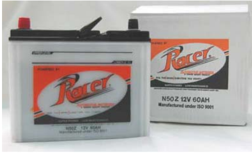
RACER BATTERY Refer to Product list