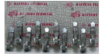
WL-1041-C10 Std Post Lead with Saddle (Card of 10)