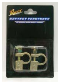
WL-1500-C2 Single Post Copper 'P' Style (Card of 2)