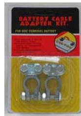
WL-1032-C2 Std Post Lead with Saddle (Card of 2)