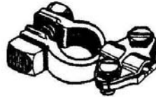
WL-1011 Jap. small Post Copper with Saddle