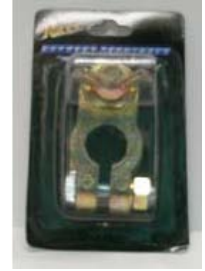
WL-1010-C1 Std Post Zinc with Wingnut (Card of 1)