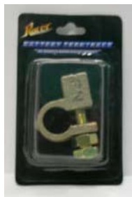
WL-1500-C1 Single Post Copper 'P' Style (Card of 1)